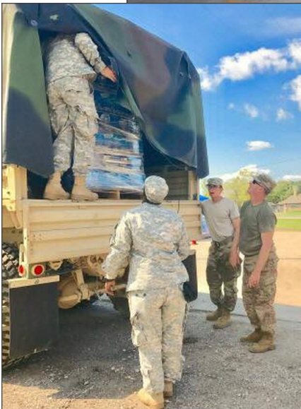
Red Dragons on the Harvey Relief mission bivouac in a parking garage