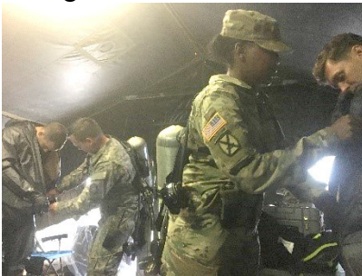
Preparing for Post-Detonation Re-Entry

When abandoned chemical munitions were found on San Jose Island, Panama, the Army gave the mission of neutralizing them to forty soldiers and leaders from the 2 nd Chemical Battalion. The 8 unexploded bombs, from a 1940s Army testing ground, contained phosgene and CK gas. The 500 lbs bombs were detonated in place, to cut open the casings, set off the internal burster tubes to mitigate the known existing explosive and chemical hazards. The mission occurred in the supposed rainy season in September and October as agreed to between the countries of Panama and the U.S. as well as treaty protocols of the Chemical Weapons Convention. Rain and a saturated tree canopy would help to mitigate how much chemical agent gasses would be released into the air. Video cameras left in position showed that upon detonation, the gas hazard covered hundreds of yards in the jungle and impacted the localized environment as expected. Despite handling of hazardous agents and explosives, not a single injury occurred during the mission.