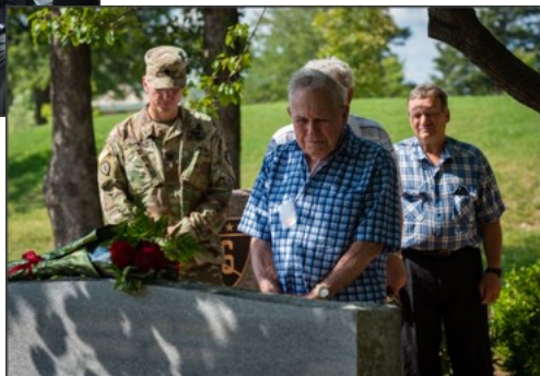
Wreath Laying Remembrance