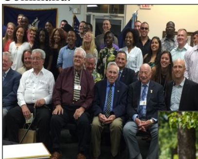
A group picture at the 2017 Red Dragon Centennial